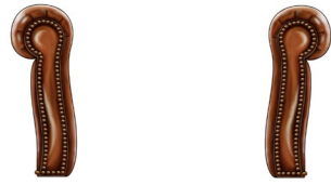
2200Lafa 2200Rafa cupholders not available on Lafa/Rafa